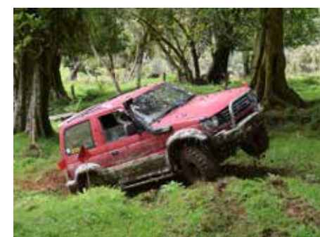
Brendan Watchorn Okoki