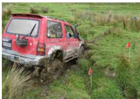
Ungraded hazard and finish blues

Check for the latest info on www.czctc.org.nz