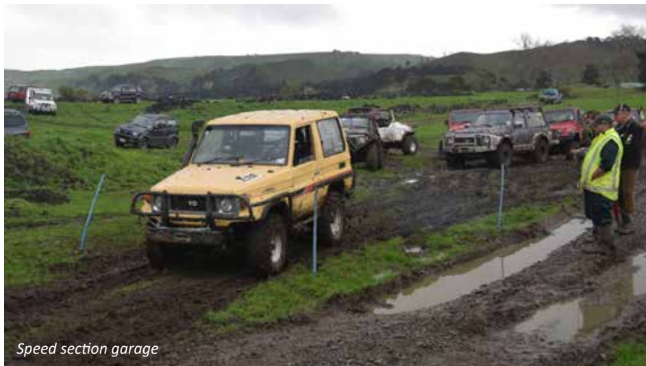
Speed section garage

The vehicles are put into one of four different Classes according to the level of modification to even up the field, the rules can be found at www.czctc.org.nz . On arriving at the site the most important thing you can do is to lower your tyre pressures to let your tyres flex and work better in mud. A modification available on a number of models is to disconnect the front sway bar, it is common in Jeeps and gives the suspension more articulation. I take out as much weight as I can by removing the rear seat, spare tyre and tools and leave that stuff in the pit area. Some people drive to the event on mild tyres and change to aggressive tyres at the site. Do your paperwork and have your vehicle and helmet inspected by an official, now you are ready to get into action. The competition is a number of "hazards", that is short courses that are designed to be impossible to clear. They are marked out by using coloured pegs, a pair of blue pegs mark the start and finish of the hazard. The route through is marked by pairs of pegs, yellow on your left and red on your right, in a graded hazard these pegs carry the score that you earn as you pass them. The majority of hazards are graded but there are other types of test, most notably the Speed section or the ungraded hazard. Finally you start to drive the hazards, first you walk the