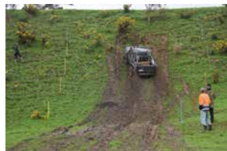
Graded hill climb