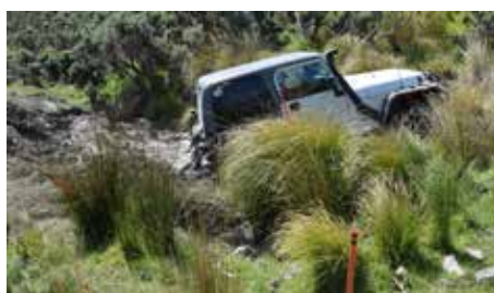
Scored 60 points